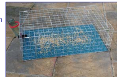
Pre-baited trap with bob-wires open

Trapping can be useful for the removal of small local populations of pigeons. Find a suitable site within the flock territory that is not overlooked by the public. Estimate number of birds present and (1 for every 50 birds in flock); pre-bait around and in open trap; replenish bait daily, gradually reducing bait on outside; when consistent takes set trap to catch with food and water inside the trap. Visit at least once per day. When catches are high visit twice a day. Remove trapped birds through top door and kill humanely using neck dislocation, using e.g. Semark Despatcher.