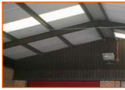
Will proof from very small holes or ledges up to vast areas

All Network products humane For durability select SS fixings All systems fairly discreet Skilled installation