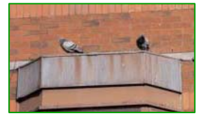
Light Pressure – occasional look out spot