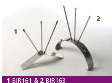
1 BIR161 & 2 BIR163