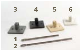
1 BIR024 2 BIR033 3 BIR007 4 BIR102 5 BIR110 6 BIR111