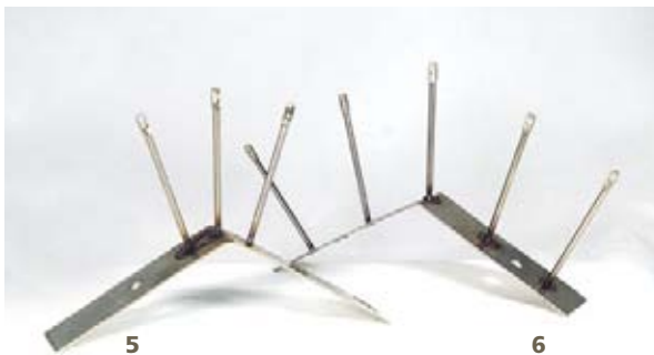
5 BIR042 & 6 BIR045