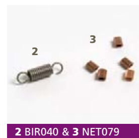
2 BIR040 & 3 NET079