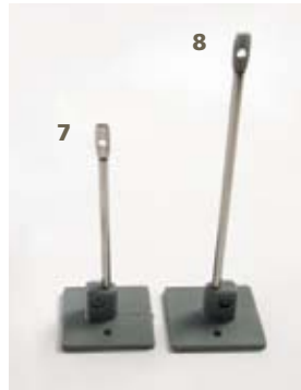
7 BIR008 & 8 BIR006

Stick-on Bird Posts are used on metal flashing, cladding and other areas where you are unable to drill. The posts are mounted in a nylon base which can be glued or screwed into place. They are used with the same Bird Wire, Springs and Crimps as the standard system.