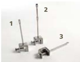
1 BIR019, 2 BIR021 & 3 BIR026