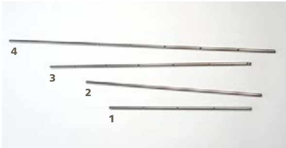
1 BIR015, 2 BIR027, 3 BIR016 & 4 BIR017

Drilled Rods are used for horizontal installation to protect wide ledges. They are installed above the ledge you are proofing and can carry a number of wires.