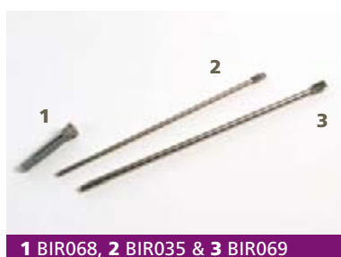
1 BIR068, 2 BIR035 & 3 BIR069