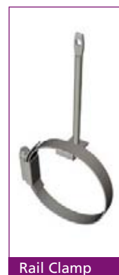
Rail Clamp & Post